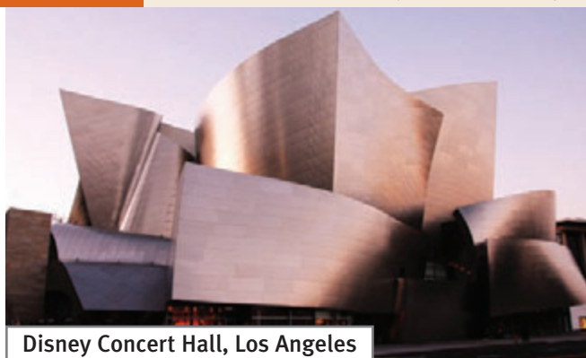
Disney Concert Hall, Los Angeles