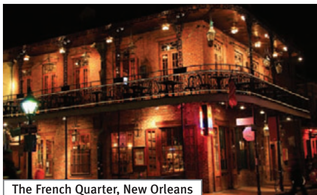
The French Quarter, New Orleans