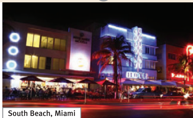
South Beach, Miami