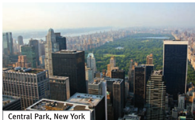
Central Park, New York