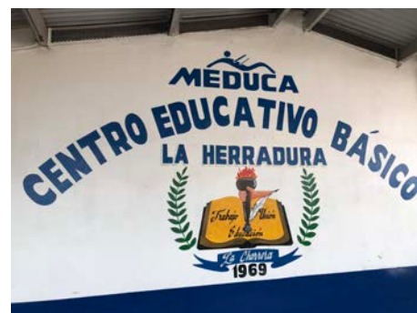
Escuela la Herradura

"The TELL assessment is taken on an ipad which the students find motivating because they get to use technology"