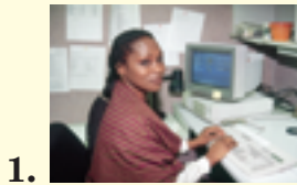
a secretary type file