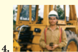
a construction worker use tools operate equipment