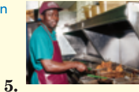
a cook use cooking equipment prepare meals