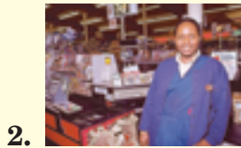
a cashier use a cash register handle money