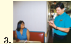
a waiter take orders serve customers