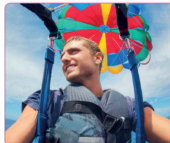
experience new things