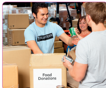
change the world