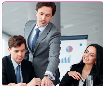
be the boss