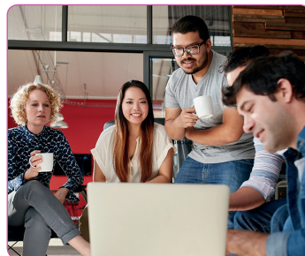
start a company