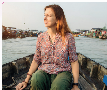
explore new places