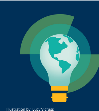
Illustration by Lucy Vigrass