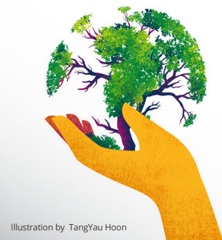
Illustration by TangYau Hoon

Pearson products and services enable people to make measurable progress in their life and career through learning.