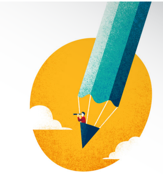
Illustration by TangYau Hoon

Pearson products and services help learners gain the knowledge & skills required for success in the 21 st Century.