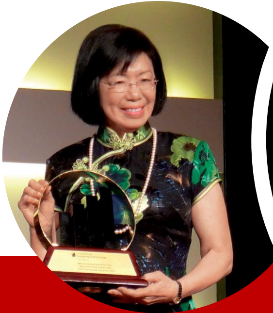
Ernst & Young Woman Entrepreneur of the Year 2011