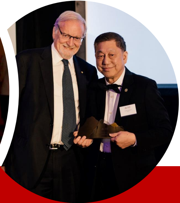
ANU International Alumnus Award 2016