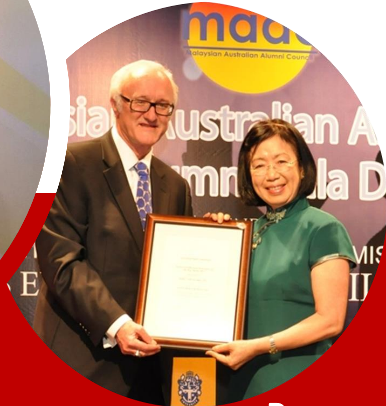
Australian Education Personality Award 2011