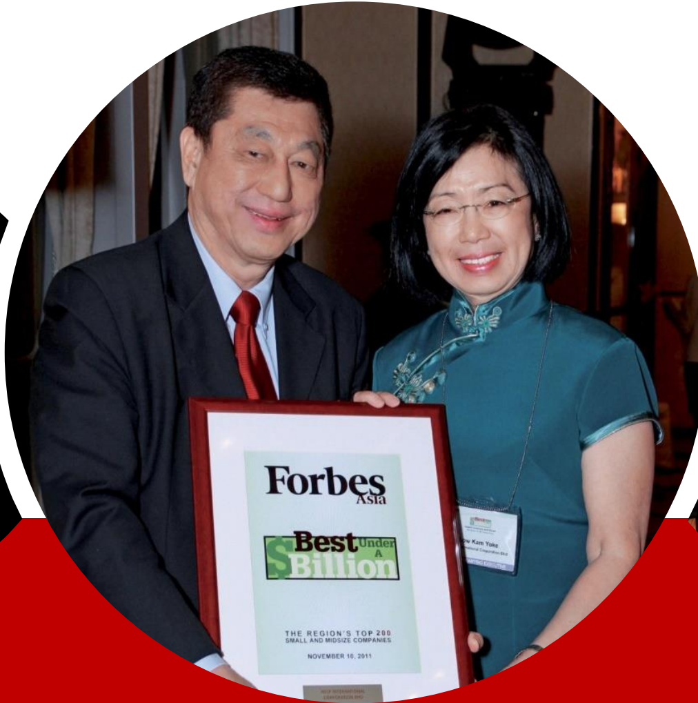
Forbes 2011 Award for Asia Pacific Top Performing Company below US$1 billion