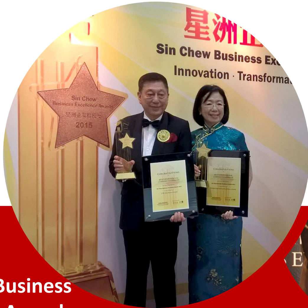
Sin Chew Business Excellence Award 2015