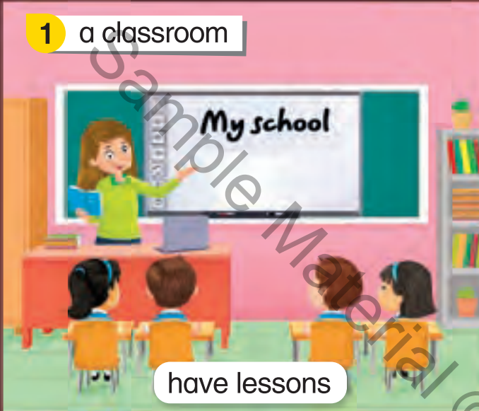
1 a classroom