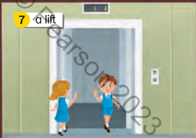
7 a lift