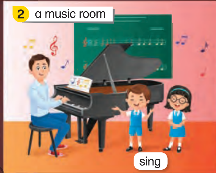
2 a music room