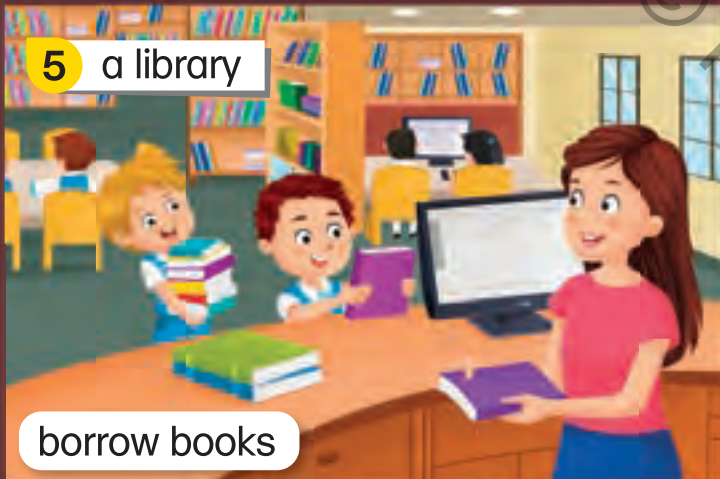
5 a library