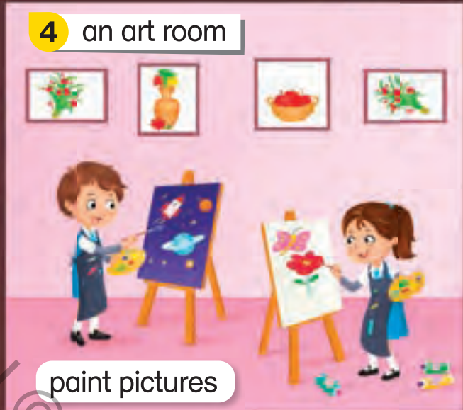
4 an art room