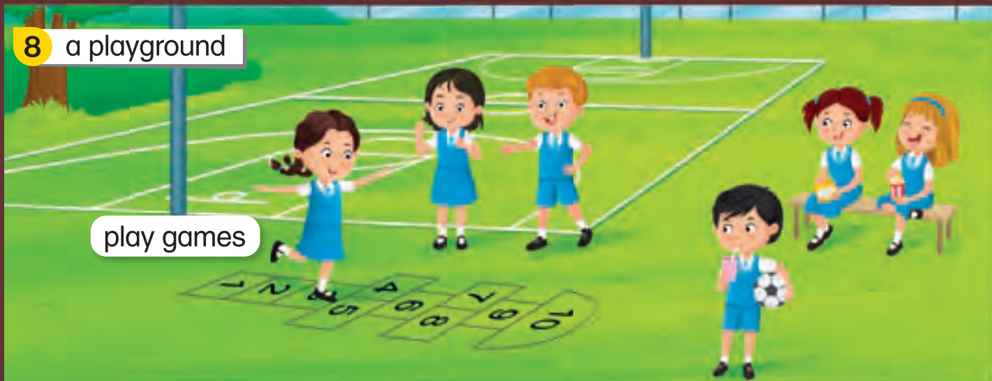
8 a playground