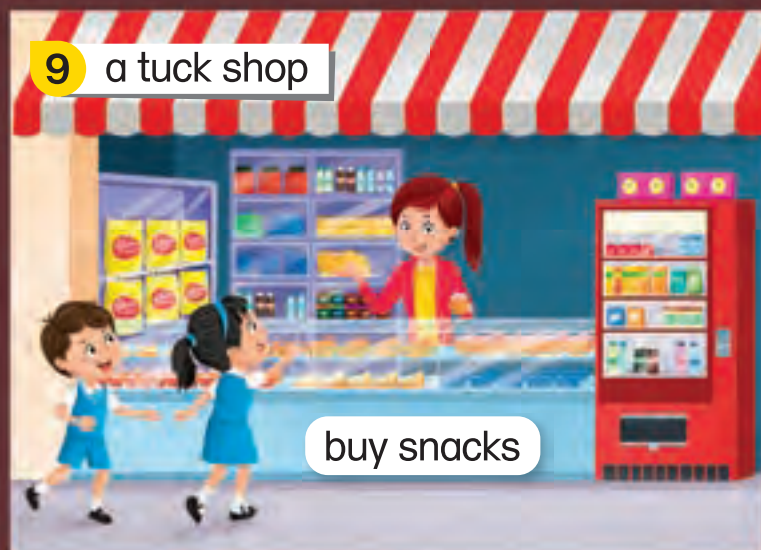
9 a tuck shop