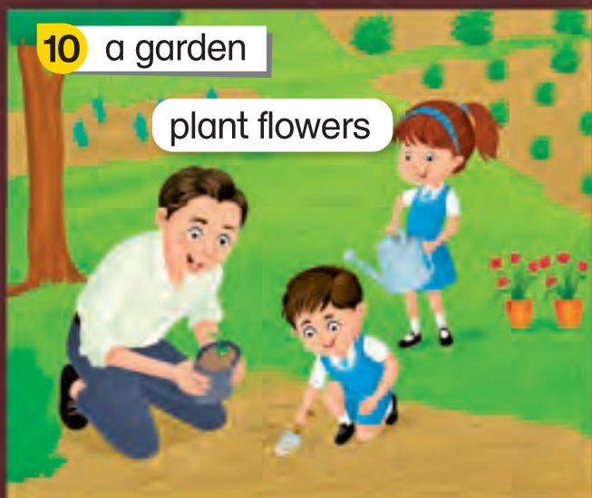
10 a garden