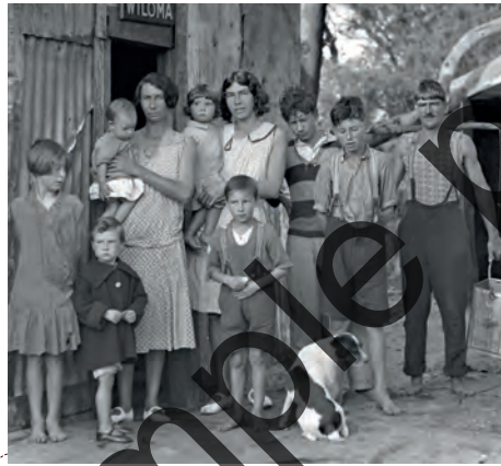
SOURCE 1.1.5 Depression-era slum living in Sydney, New South Wales, around 1934

In Australia, as elsewhere, queues of desperate men hoping for even short-term employment were commonplace. Unemployment often meant the loss of everything. Families that could not pay their rent or mortgages were evicted. Makeshift shanty housing made from discarded materials sprung up on the outskirts of many towns and cities. The harsh living conditions experienced by these now impoverished people created other disadvantages in areas such as health and education.