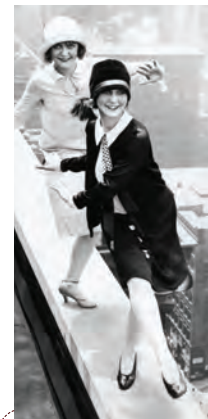
SOURCE 1.1.3 Two 'flappers' dancing on a Chicago building rooftop ledge in 1926

The Jazz Age found strong expressions in other countries, especially France. US writers Ernest Hemingway, F. Scott Fitzgerald and Gertrude Stein and the daring African-American entertainer Josephine Baker lived and worked in Paris at that time. Following a major exhibition in Paris in 1927, France became the centre of the art deco styles that reshaped Western tastes in architecture and interior design. In Australia, the US Jazz Age influences in music, fashion and dance were strong. US films were also very popular in the 1920s; unfortunately, however, this contributed to the decline in Australia's previously thriving film industry.