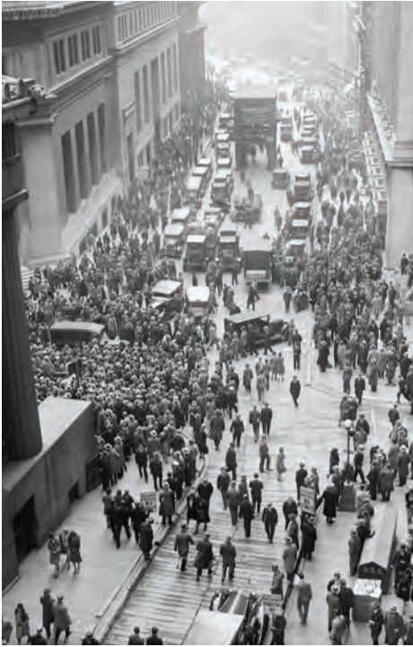
SOURCE 1.1.4 Crowds of Americans rush to Wall Street in 1929 to try to recover their savings.

Wall Street in New York City is the home of the US stock market. In the 1920s economic boom, it was a source of quick wealth for many investors. Companies issued stocks to raise capital and, while their value was climbing, investors could sell them and make a profit. In late 1929, however, many investors realised that they had paid too much for many stocks and started selling to avoid losing money. Panic set in among investors. By 29 October, the stock market had lost 47 per cent of its value. This date in history is known as the day of the Wall Street Crash . Many investors lost all their money. Even though only about 1 per cent of Americans owned shares in 1929, the impact of the Wall Street Crash was severe because most of those who did also owned companies. As their companies failed, workers lost their jobs and that meant consumption of goods fell rapidly, closing more businesses and leading to more unemployment. The US economy was in the grip of a depression .