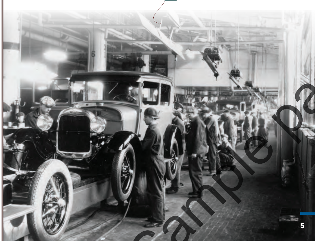
SOURCE 1.1.1 Henry Ford's production line—the beginning of mass production

Mass production was increasingly adopted in other countries. For instance, it allowed for the take-off of Australian car manufacturing, as US companies such as Ford and General Motors started to make cars in Australia. In 1920–21, there was one car for every fifty-five Australians. By 1929–30, the figure was one for every eleven Australians. As traffic increased in cities, another 1920s invention was required: traffic lights. The growth of car usage and improved rail travel gave rise to expanding suburbia in Australian and many other cities in the Western world.