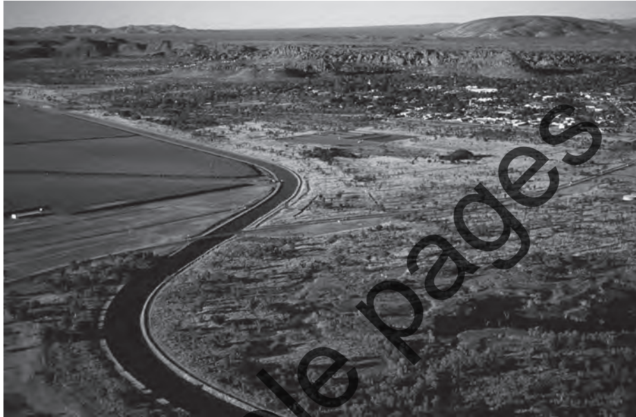
2.01 Ord River, Kununurra, Kimberley region, Western Australia

'Landscape' is the term used to describe the visible features of an area. These features are called 'elements' and include natural, living, human and changeable elements.