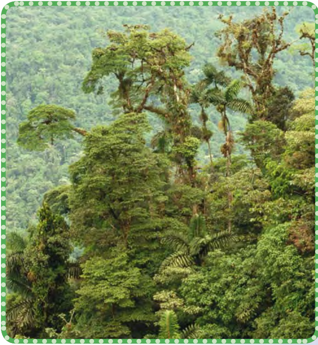
a tropical rainforest