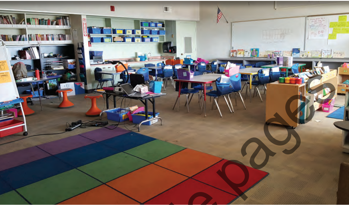
Faith's Classroom Environment

activity and moving into the mathematics block of the day. In Mary's classroom, space was used flexibly, as students chose where to work, creating workspaces out of tables or even the floor in the corner of the room. How students interacted within the classroom environment in part shaped what was possible for their mathematical work.