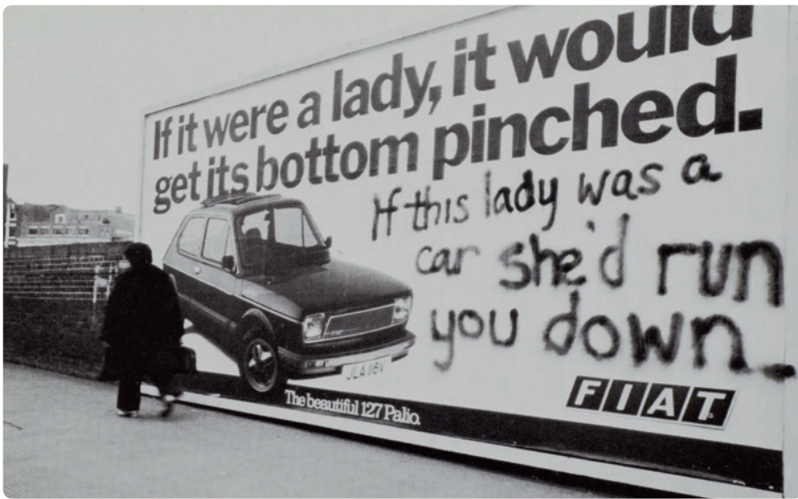
Source 1.2.1 FIAT advertisement from the 1970s

The women's movement also developed in the 1960s to fight for equality between the sexes. In 1983, Australia signed the UN Convention on the Elimination of all Forms of Discrimination Against Women. In the US, a law was passed against sexual discrimination in 1964. In the UK, a similar law was passed in 1975. In Australia, equal pay for equal work for men and women was phased in after 1969.