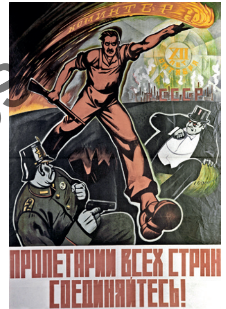
Source 1.3.1 A USSR propaganda poster created in 1966 by an unknown artist. The text reads, 'Proletarians of all countries, unite!'

It is important to realise that there was not a neat division of the world into two opposite camps. China, for example, was a communist power like the USSR, but was not allied to it. Some countries, especially in Africa and South America, were referred to collectively as the Third World , and were seen as potential allies and areas for economic and political competition between the two powers. Others, such as Yugoslavia and India, remained neutral.