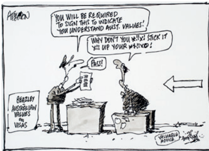
Source 1.2.2 Testing for Australian values, Michael Atchison, The Advertiser , September 2006

Other civil rights movements that experienced significant growth from the 1960s onwards in Australia and throughout the world included those which fought for the rights of migrants, homosexuals and asylum seekers, all of whom strived for equality and fairness of treatment. In many cases, they are still striving for civil rights. Gay rights movements in the US and Australia, for example, now focus on achieving equality in the areas of pensions, immigration rights, parenthood and marriage.