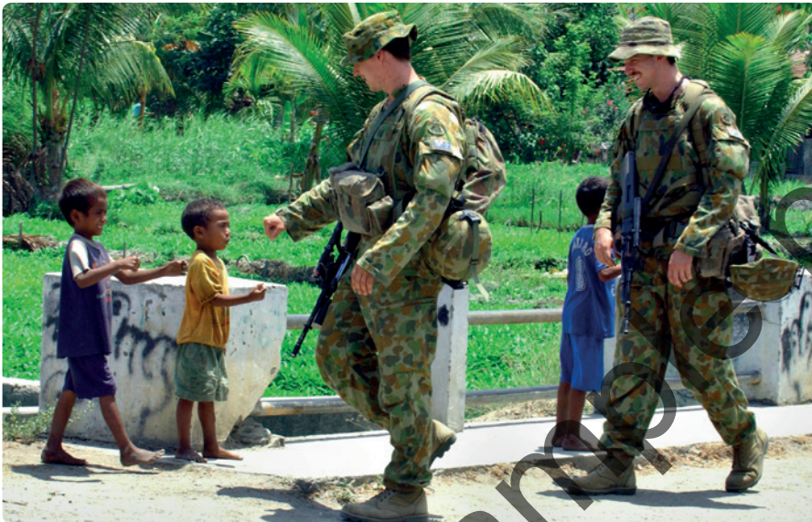
Source 1.1.4 Australian peacekeepers in East Timor, 2010